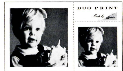
4" x 2 column Press Advertisement for dealer use