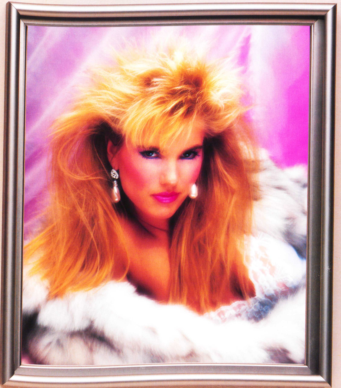
KODAK VERICOLOR HC Professional Film. High Contrast.