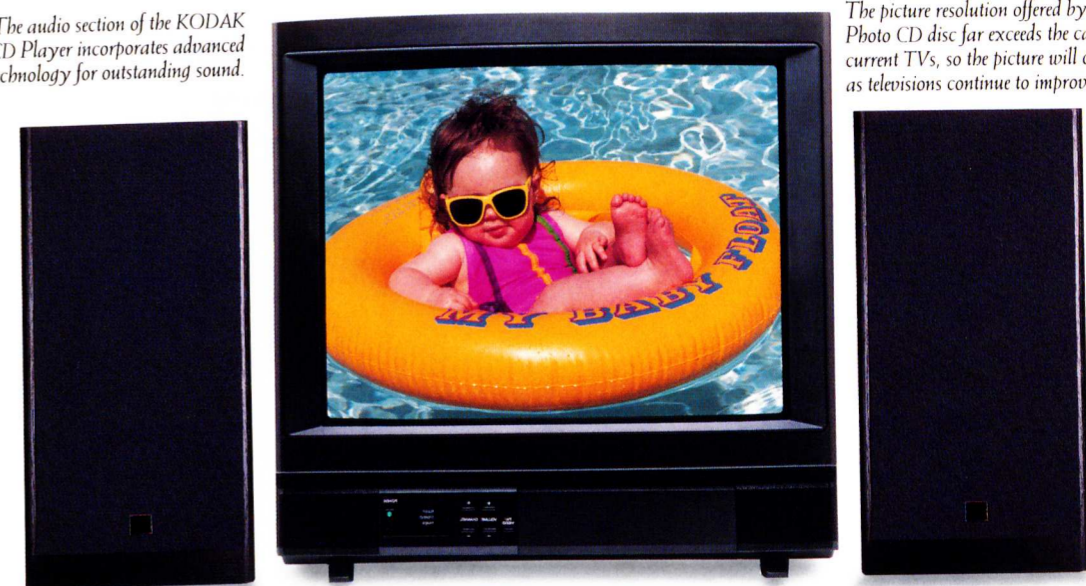
TV image simulated

The picture resolution offered by a KODAK Photo CD disc far exceeds the capabilities of current TVs, so the picture will only get better as televisions continue to improve.