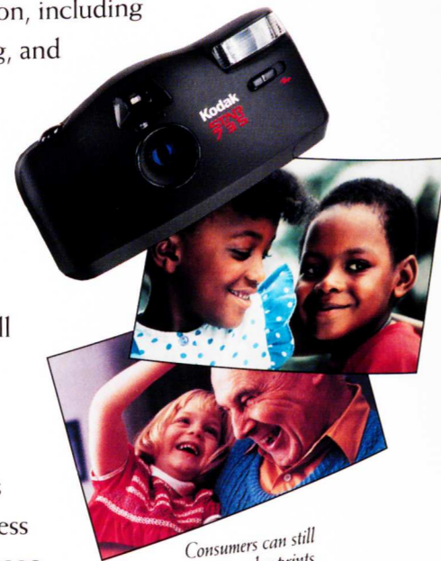
Consumers can still receive color prints

The Photo CD system is a product designed to meet the expressed wishes of consumers.