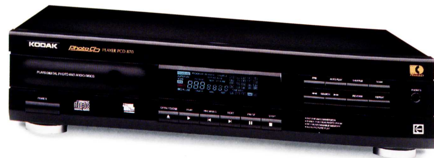
And now they have the added benefit of viewing their pictures on TV as well.