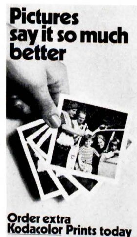
5" x 2 column press advt.