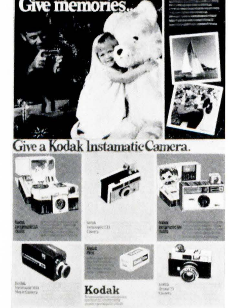
Right: Full page, full color newspaper advertisement.