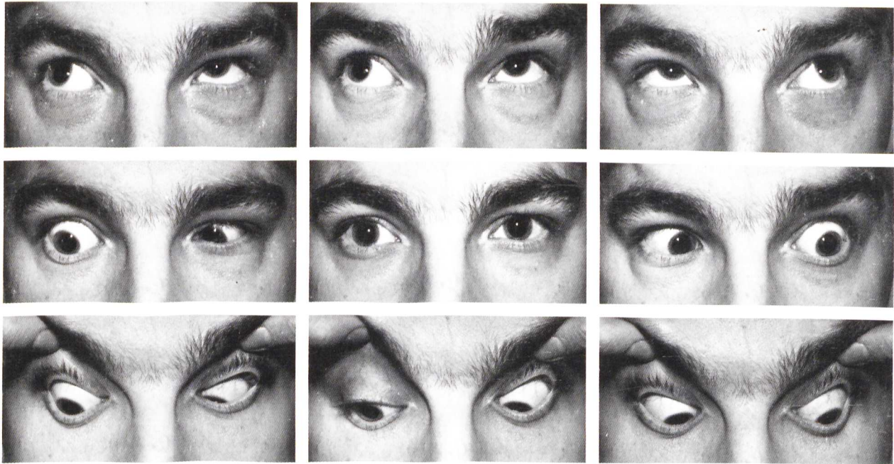
Positions of gaze: 1—primary, 2—secondary, 3—tertiary