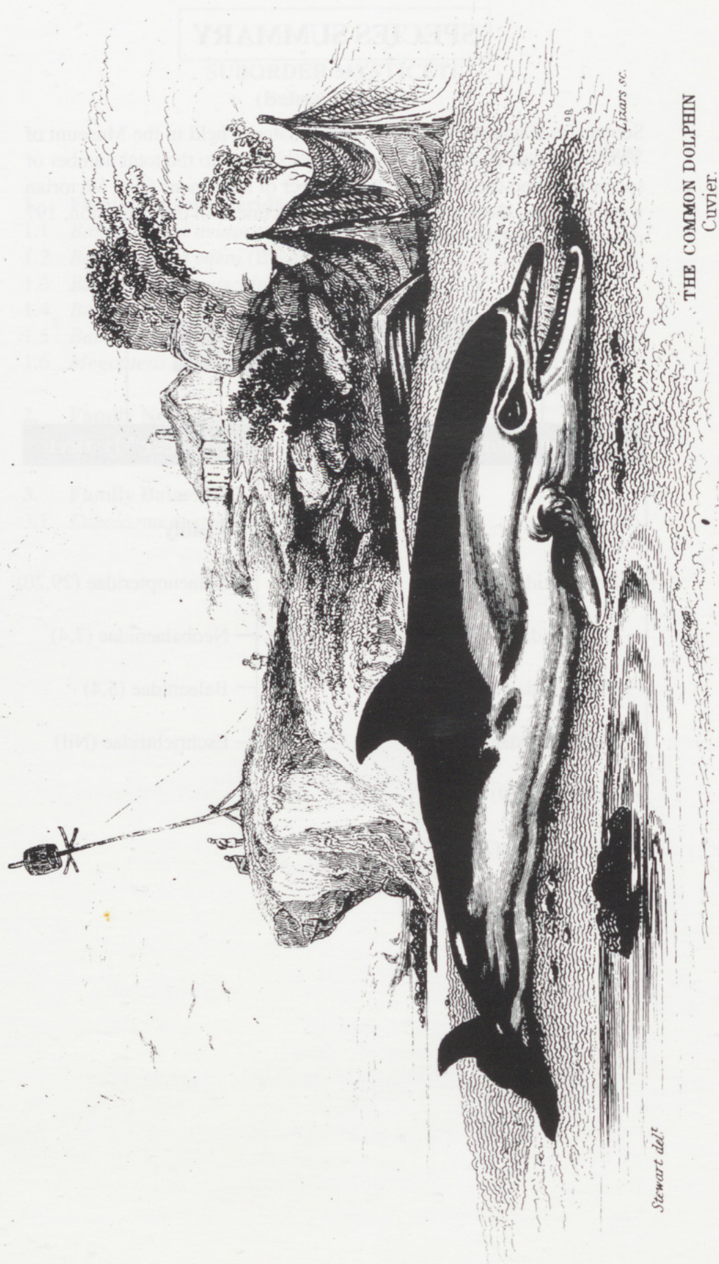
THE COMMON DOLPHIN Cuvier.

COMMON DOLPHIN – Plate from The Naturalist's Library 1852 by W. Jardine