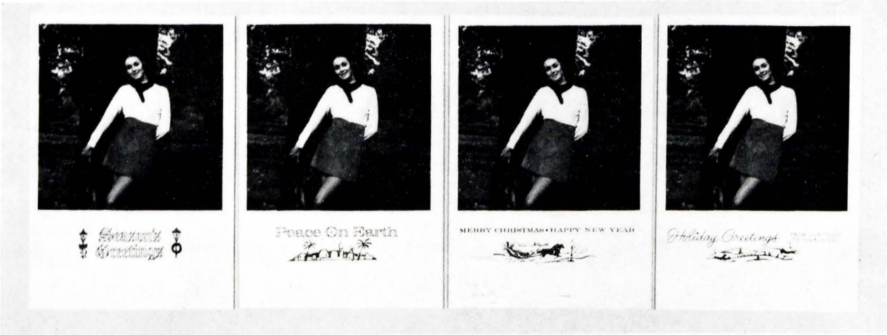
These Kodak Trim-Line Photo-Greeting Cards illustrate the range of designs available

Tell your customers about these new lower prices. Especially, point out the saving made by ordering in quantity.